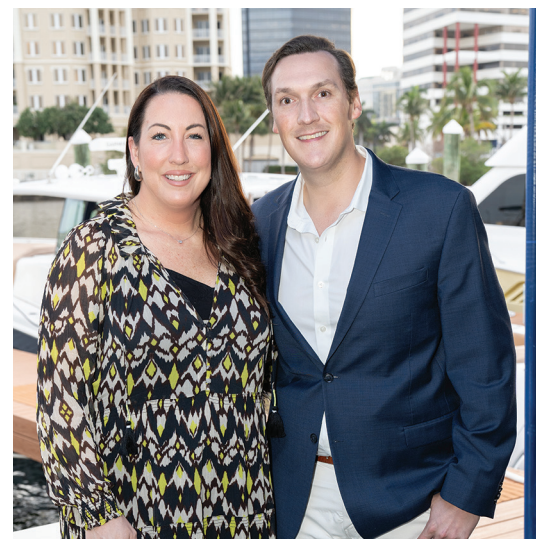
8 | March 1-7, 2024 PALM BEACH SOCIETY