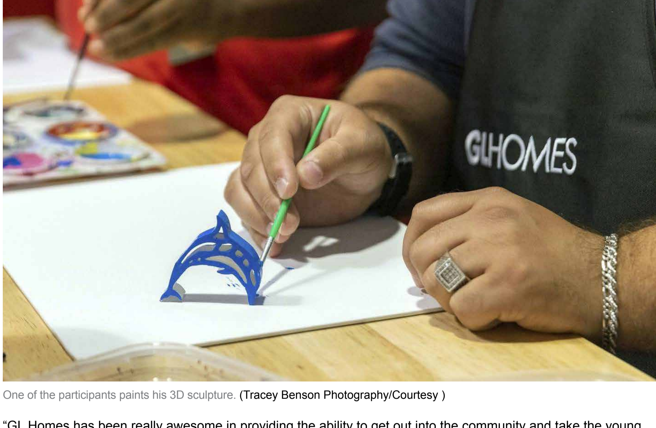
One of the participants paints his 3D sculpture.

The Legal Aid Society's GAP program in Palm Beach County provides services and support to developmentally challenged young adults who are 18 and older and reside in the county. The program has up to 20 young adults and several who have aged out of foster care. The seven GAP young adults participants from ages 19 through 43 at the event were able to design and also paint their own 3D creations.